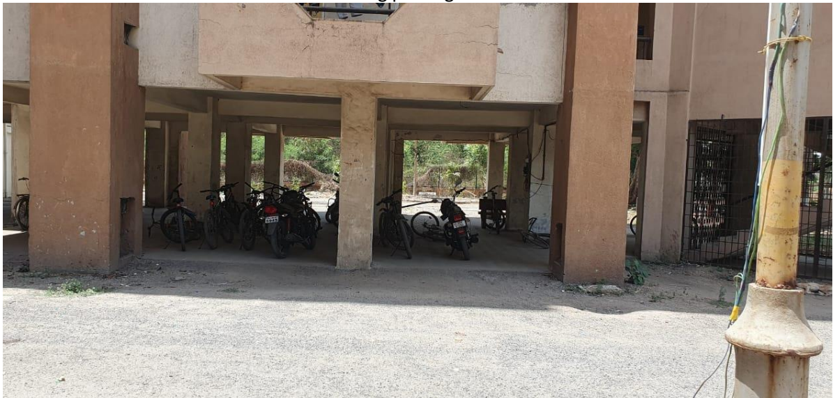
B-wing parking area