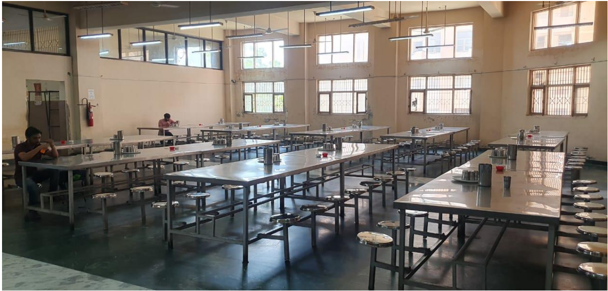
1 st -floor Dining Area Mess -2