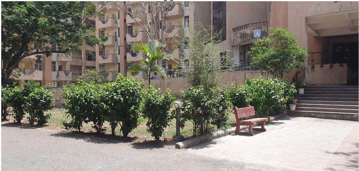
A-wing garden area