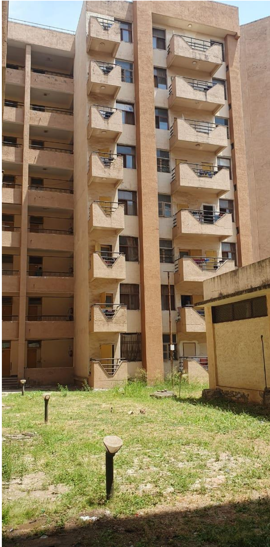
A-wing said parking area