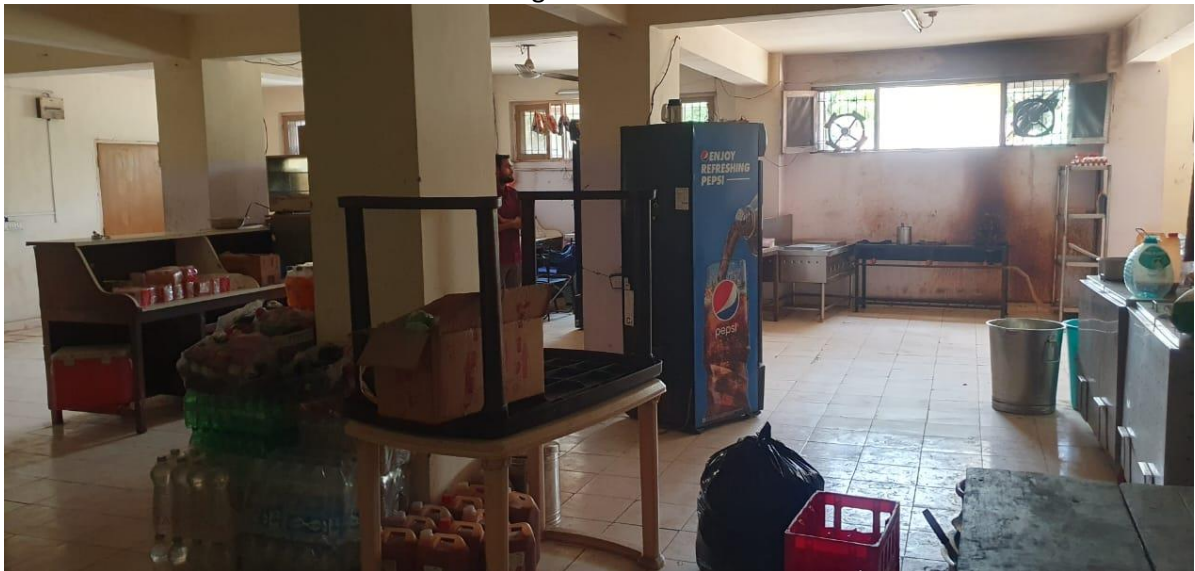
A-wing ground floor Night canteen-1 (3)