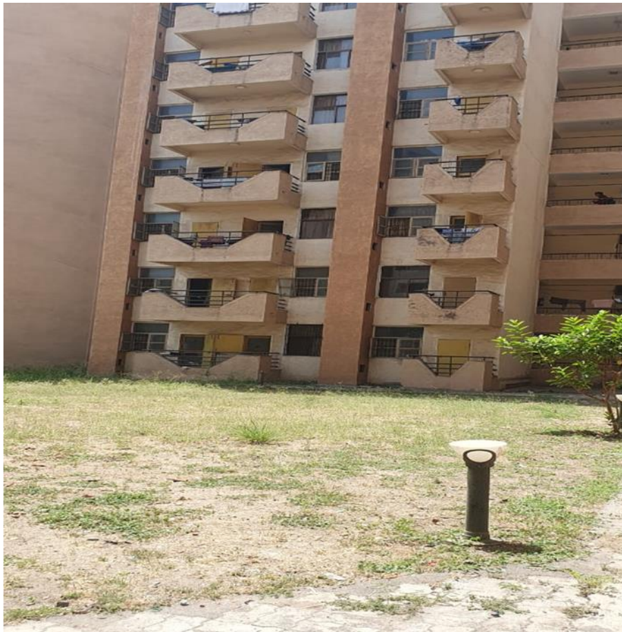
B-Wing parking area