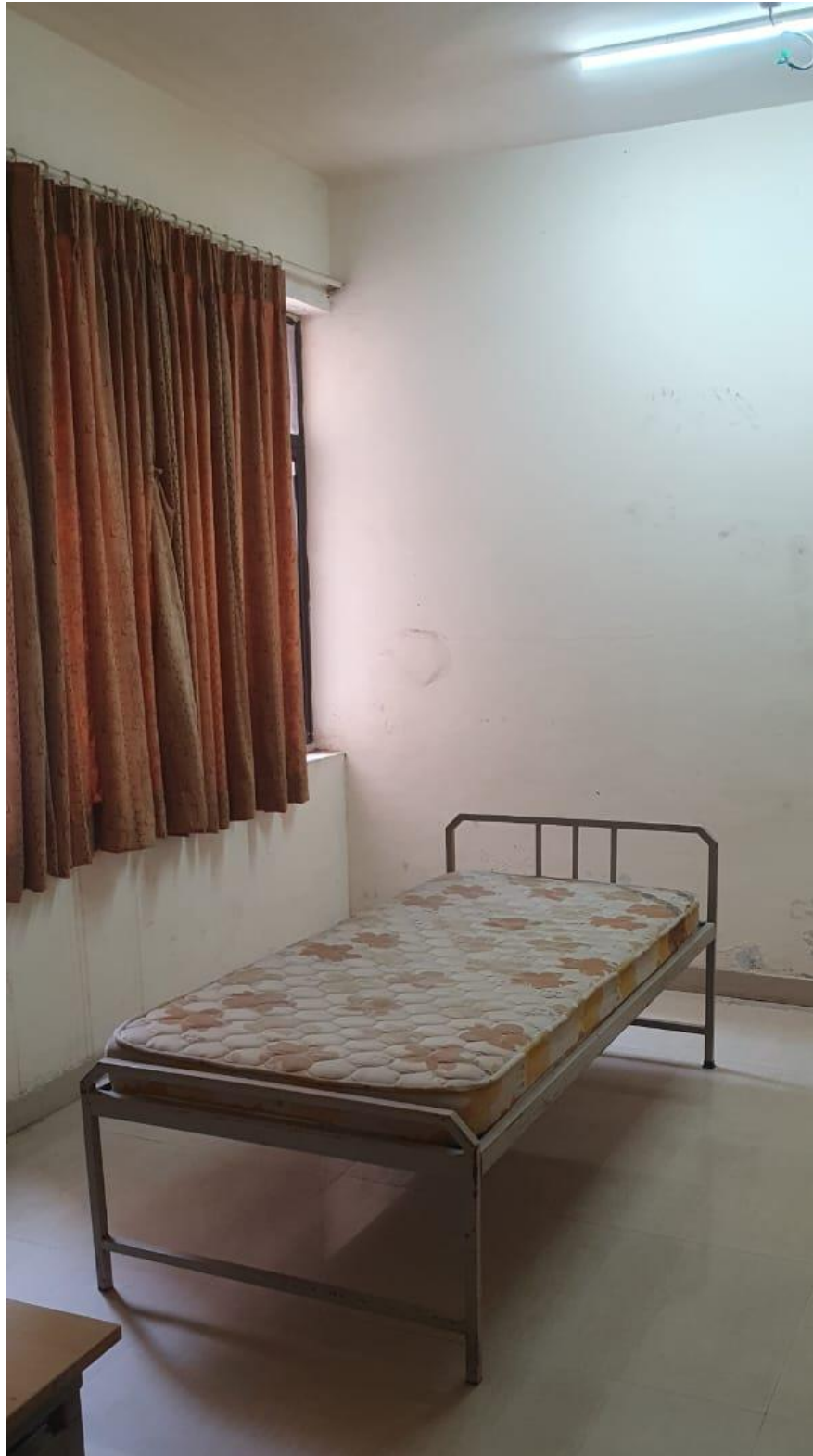
2 nd floor Guest room-1