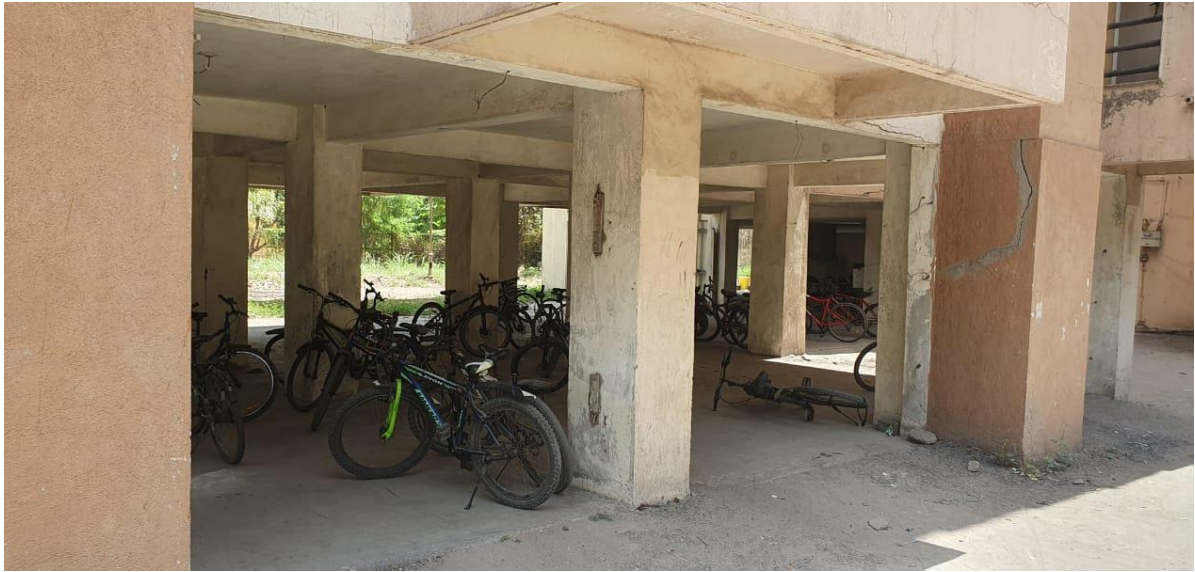
A-wing parking area