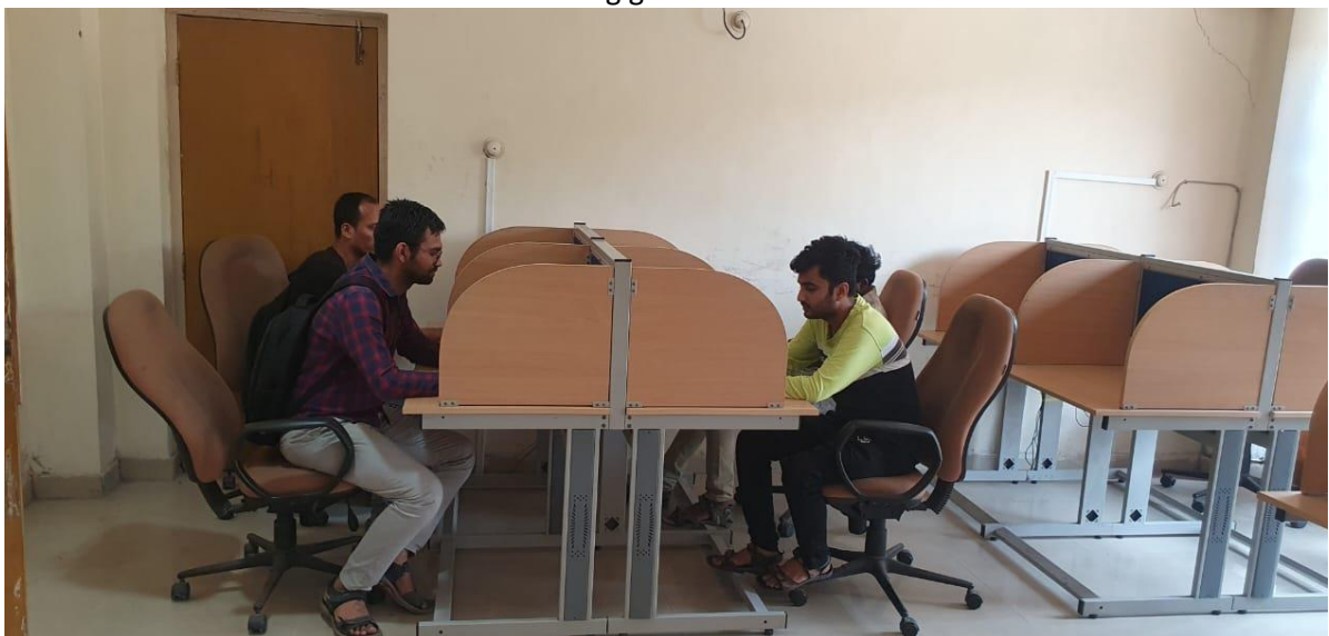
2 nd floor reading room