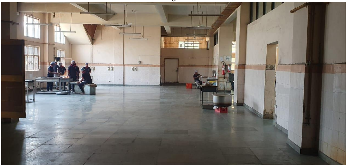
1st-floor Mess -2