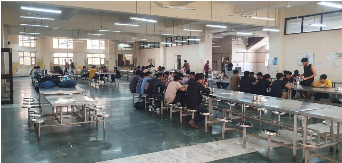
1st-floor Dining Area Mess-2