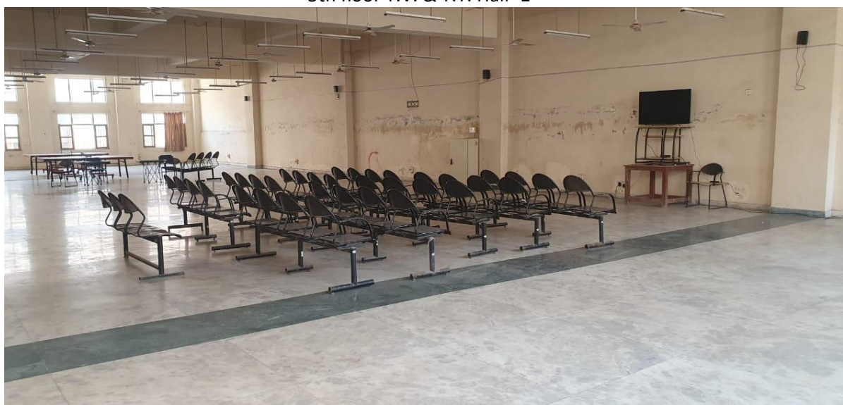
5th floor T.V. & T.T. hall -1