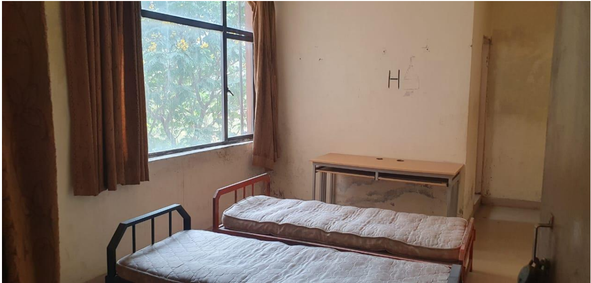
3 rd floor Guest room-3