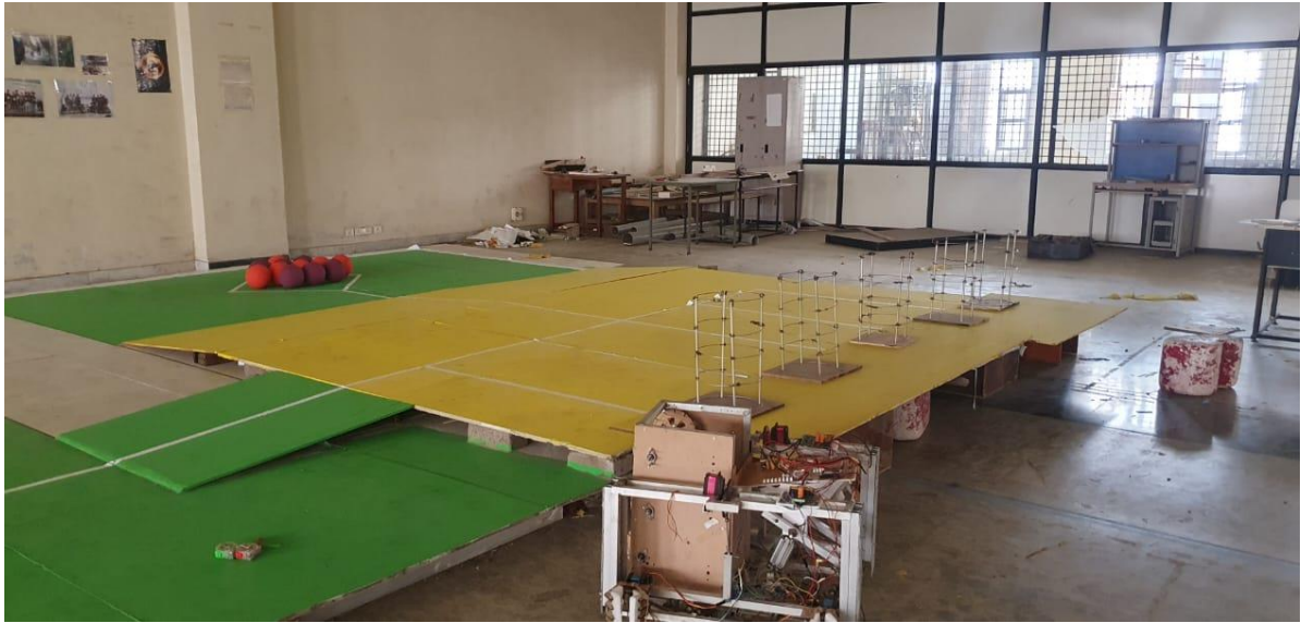
4th floor CCF HALL -1