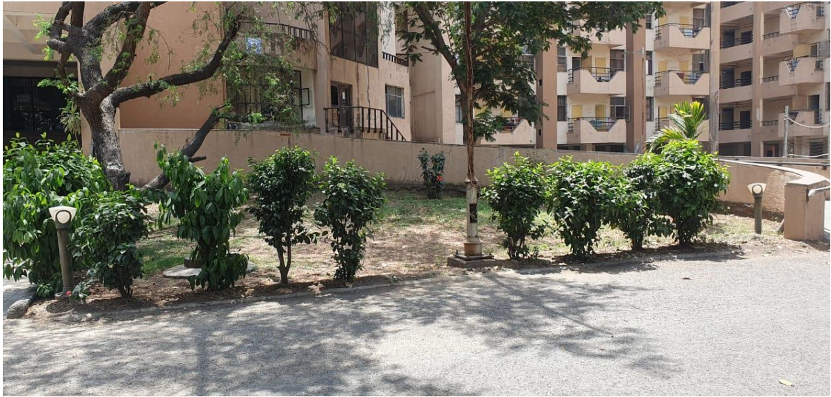
B-wing garden area