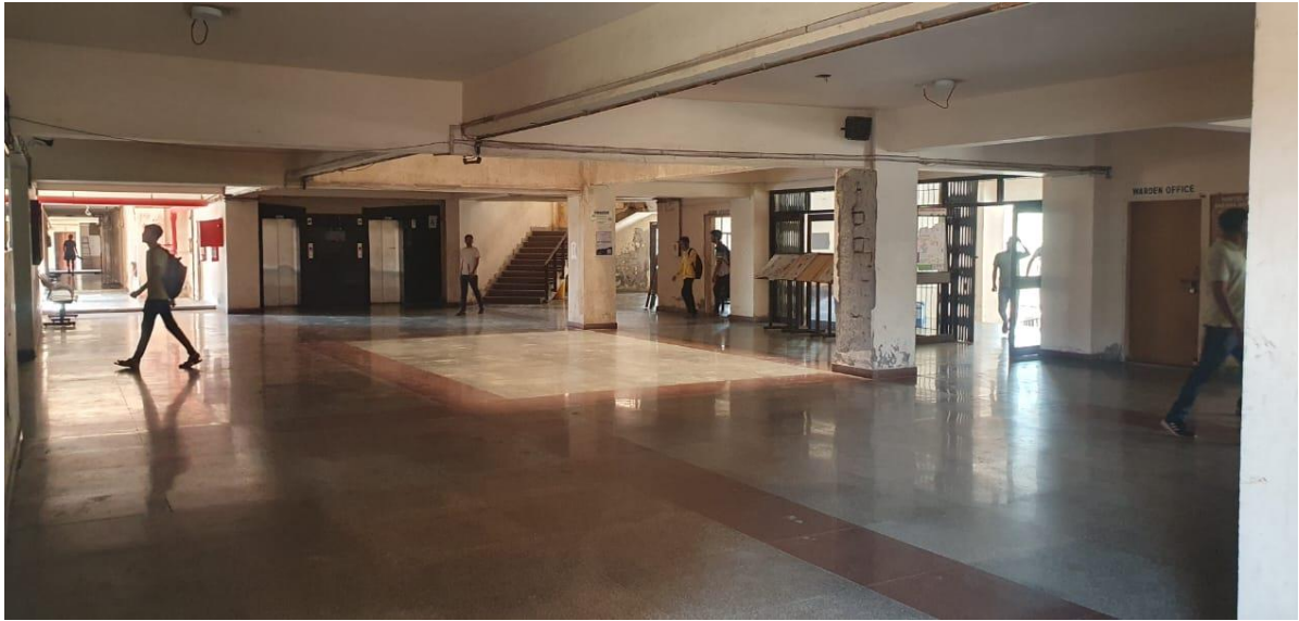
Main gate inside area