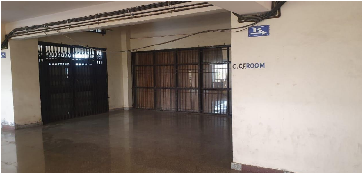
4th floor CCF HALL -1 (2)