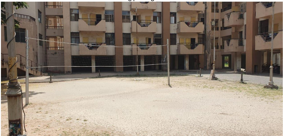
B-wing volleyball ground area