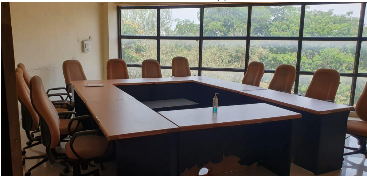
3rd-floor conference room -1