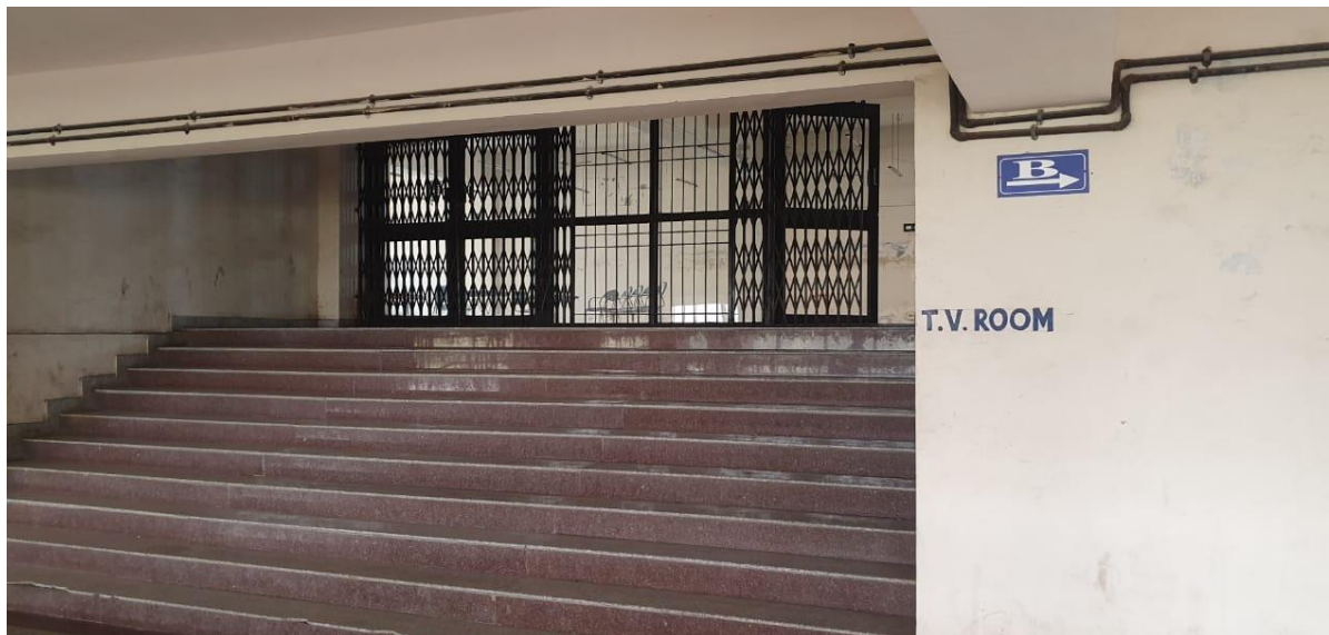
5th floor T.V. & T.T. Hall -1